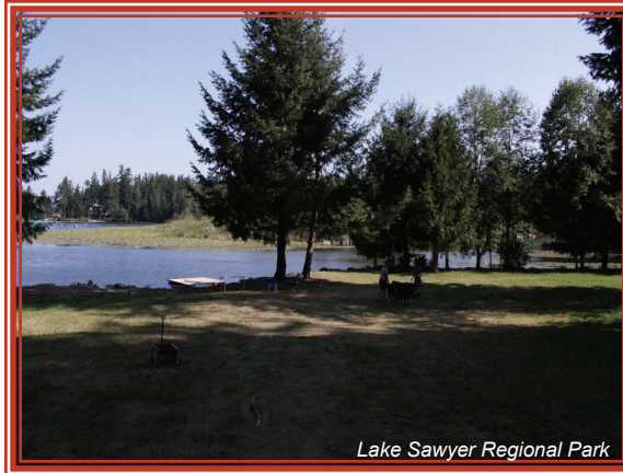
Lake Sawyer Regional Park

It is unlawful for any person to build a fire in any park. The city may prohibit barbecues, or other sources of flame within any city park whenever, in the opinion of the Fire Chief, allowing such activities would create risk of