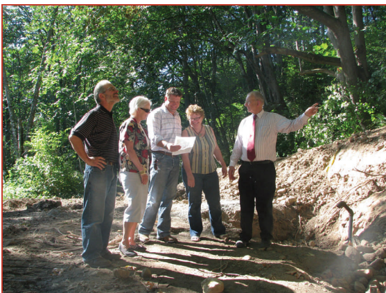
King County Councilman Dunn along with Mayor Botts, Councilmembers Olness and Mulvihill and Bill Kombol discuss the in-city forest water project.

Several years ago, late Congresswoman Jennifer Dunn secured a $240,000 grant to assist the City of Black Diamond with the replacement of a section of water supply line. The City is wrapping up this significant improvement to the City's water system. A portion of an old 1945 asbestos water main was replaced east of the City.