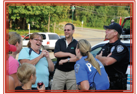
Black Diamond Police visiting with community members